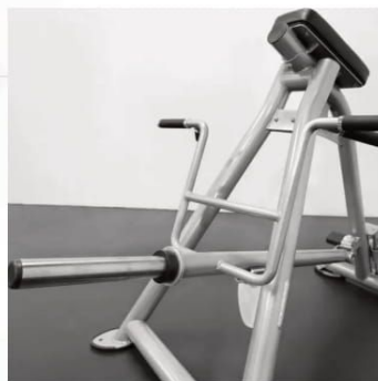
Plate Loading Design