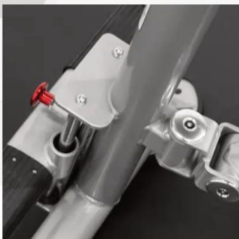
Chest Pad and Foot Plates Secure upper torso to isolate lats/rear deltoids