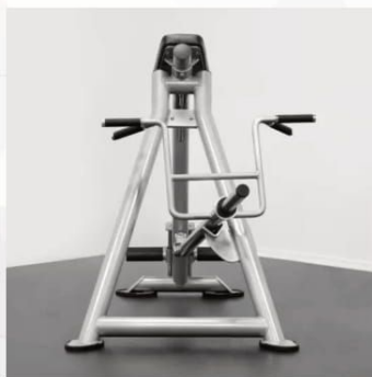
11-Gauge Steel Mainframe Frame is protected by a durable powder coat finish