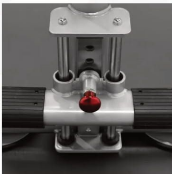
Adjustable 7 Position Footplate Accommodates users of different heights