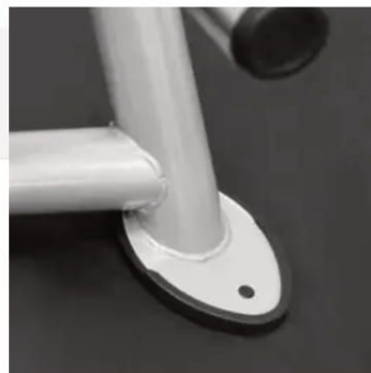
Rubber End Caps To protect flooring